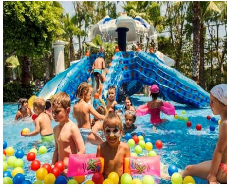
Children Pool 2