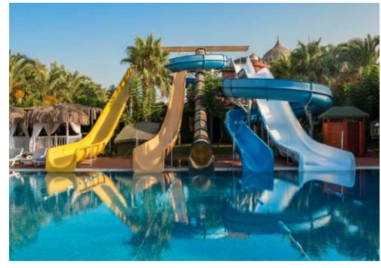
Pool with Waterslide

Main Pool; Technical details; depth 1.40 m, area 1800 m 2 Children's Pool; Technical details; depth 40 cm, area 200 m 2 Relax Pool; Technical details; depth 1.40 m, area 750 m 2 Pool with waterslides; Technical details; depth 1.40 m, area 225 m 2 Indoor Pool; Technical details; depth 1.40 m, area 245m 2 Indoor Children's Pool: Technical details; depth 40 cm, area 30 m 2