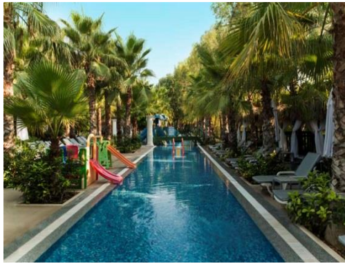
Children Pool 1