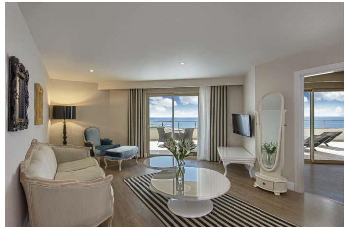
Suite Living room

Suite: in total 2 bedrooms, 58 m 2 , 1 bedroom (1 double bed), 1 living room, 1 shower/WC and terrace (jacuzzi is located on the terrace). The feautres are air conditioning (central, between certain hours), hair dryer, direct telephone, LCD TV (satellite), music, safe, mini bar, Laminate, kettle, tea and coffee. Every day housekeeping, towels are changed every day, and sheets once every 2 days. View of the room: Sea Side View (Accommodation type maximum 2 adults).