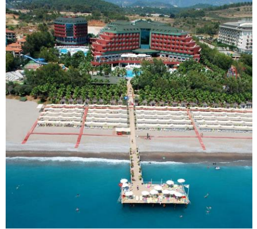
Main Building and Annex Building