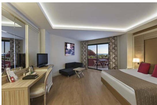
Family Room (Parents)

Technical Details Hotel for Disabled Guests: in total 5 rooms, have the same features as the standard rooms, an emergency button, shower / WC are available. The rooms have Land View. Technical details: door 80 cm, balcony door: 85 cm, elevator door: 80 cm, bathroom door: 80 cm. The reception, restaurants, swimming pools and the beach are accessible with a wheelchair.