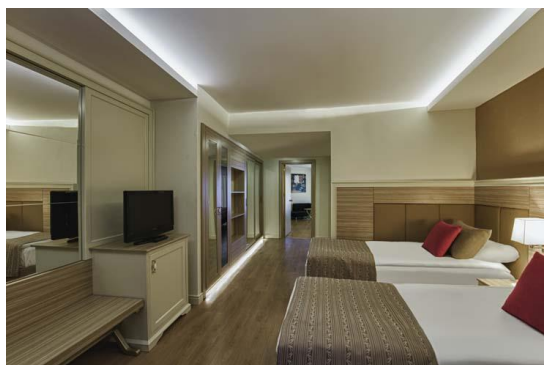
Family Room (Children)

Family Room: 43 m 2 . There is 1 parents room (1 french bed + 1 sofa), 1 children room (2 Single bed), LCD-TV, shower / WC, minibar, telephone, laminate flooring, balcony, safe, hair dryer Everyday: room cleaning, change of towels. Once Every 2 days: change of bed linen (Accommodation maximum: 3+2 or 4+1) (Sofa Bed: 179 x 75 cm).