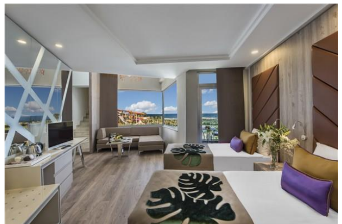
BE Family Loft