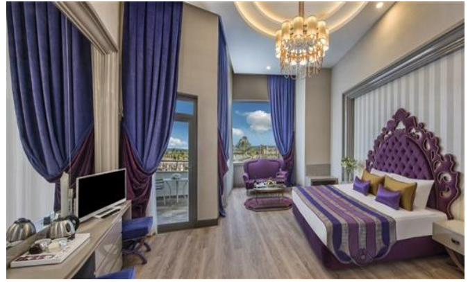
BE Delux Loft

BE ROMANTIC: in total 56 rooms, each room is 32 m 2 . In each room is 1 french bed (Maximum Accommodation: 2 adults). In the rooms there are Balcony, shower / WC, air conditioning (central and between certain hours), hair dryer, direct dial telephone, LCD TV (satellite), music, safe, mini bar, Laminate, kettle, tea and coffee. Every day housekeeping, towels are changed every day, sheets are changed once every 2 days. The rooms have Side Sea View or Land View.