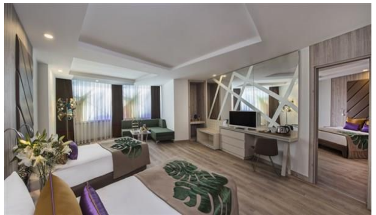
BE Family B