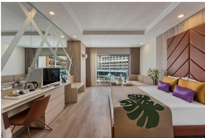
BE Family A